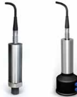
Gauge pressure Differential pressure