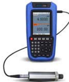
Additel 160 Application